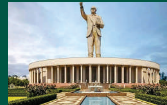
Ambedkar Statue - 20 mins