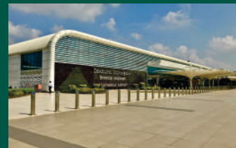
Gannavaram Airport - 20 mins