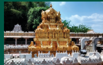
Durgamatha Temple - 15 mins