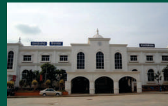
Railway Station - 20 mins